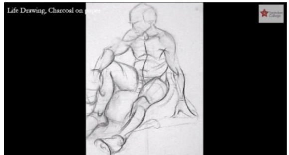
Life Drawing, charcoal on paper, Swindon College, 2007.