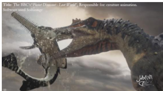
Shot 11-15, , Planet Dinosaur : BBC TV documentary series. Episode 1: Lost World . Episode 6: The Great Survivors April 2010 to March 2011. Jellyfish Pictures Ltd.