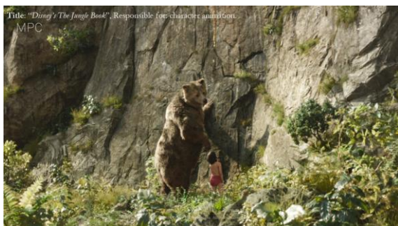
Shot 2-4, Disney's The Jungle Book : Feature Film directed by Jon Favreau. MPC, London