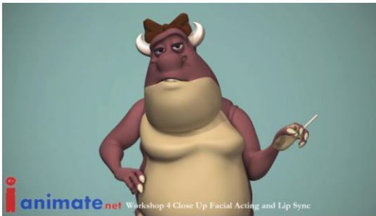
Shot 18 Faded Image : iAnimate Workshop 4: Close up Facial Acting and Lip Sync. Assignment 1.

Responsible for: Character Animation. Software: Autodesk Maya.