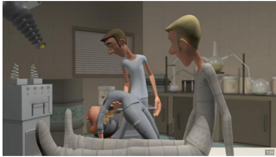
Shot 17, Spark of Life : July 2014. Personal Project .

Responsible for: Character Animation. Software: Autodesk Maya.