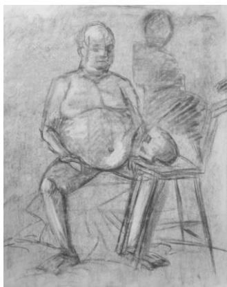
Life Drawing, charcoal on paper, London Drawing, 2014.