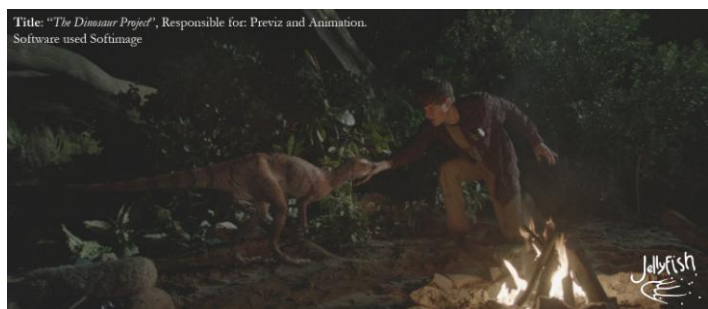
Shot 9-10, The Dinosaur Project : Action adventure feature film directed by Sid Bennett. August 2011 to December 2011. Jellyfish Pictures Ltd.

Responsible for: Previs and animating creatures to live action back plates.