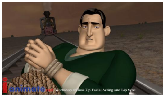
Shot 1, Not my Life : iAnimate Workshop 4: Close up Facial Acting and Lip Sync. Assignment 2.

Train from: http://www.turbosquid.com/3d-models/free-max-mode-0-6-0-steam-locomotive-narrow/782975