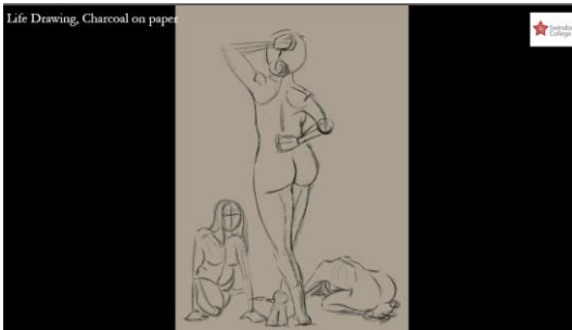
Life Drawing, charcoal on paper, Swindon College, 2007.

Responsible for: Character Animation. Software: Autodesk Maya.