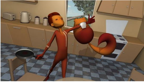
Shot 16, Snack Attack . June 2014. Personal Project .

Rigs From: http://www.animationmentor.com/free-maya-rig . Stewart character used with permission (© Animation Mentor 2013). No endorsement of sponsorship by Animation Mentor. Audio From: http://www.11secondclub.com/