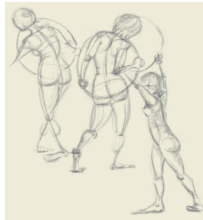
Life Drawing, charcoal on paper, London Drawing, 2014.